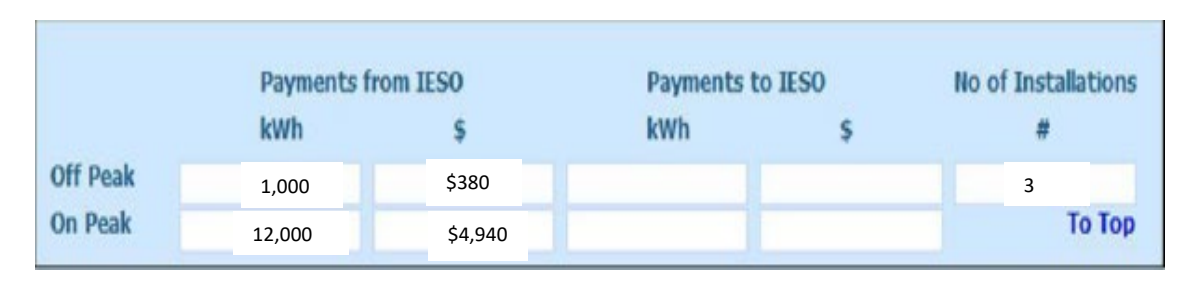
Table 4: Excerpt from IESO EG Settlements Submission for FIT and MicroFIT

These amounts are subsequently reflected on the June 2018 IESO invoice to the distributor under Charge Type 1412.