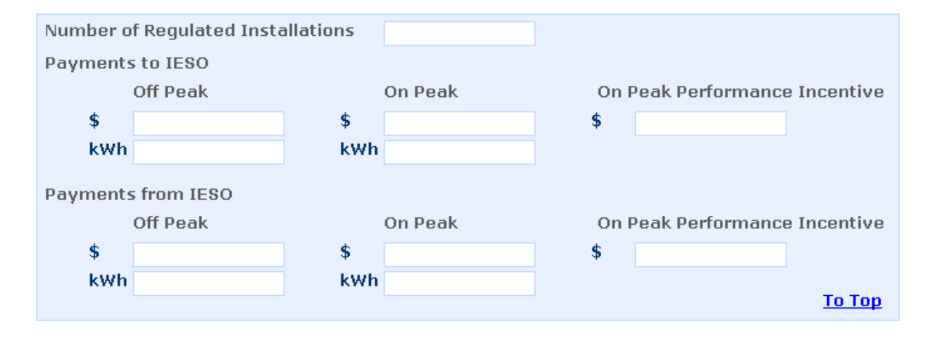
Figure 2: Claims for the RESOP

The amounts paid to EGs at the contract price should be recorded in Account 4705, Power Purchased. The settlement amount under CT 1410 is also to be recorded in Account 4705, Power Purchased.